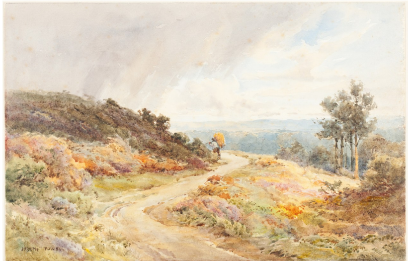
Autumn by Joseph Rubens Powell, 1835/1871, watercolor over graphite on wove paper, National Gallery of Art, Washington, DC