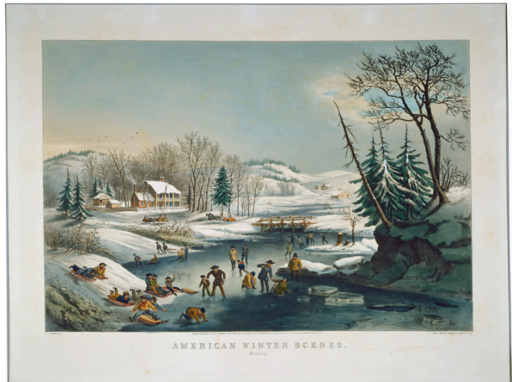
American Winter Scenes: Morning by France Flora Bond Palmer, 1845.