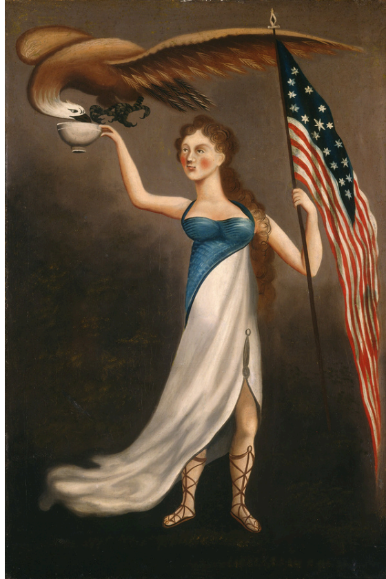
"Liberty." 1800/1820.