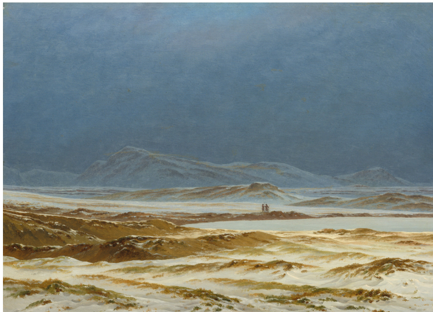
Northern Landscape, Spring by Caspar David Friedrich (1825). Courtesy National Gallery of Art, Washington, DC.

This poem is in the public domain. Classical Korean Poetry: More Than 600 Verses since the 12 th Century (Fremont, California: Asian Humanities Press, 1994).