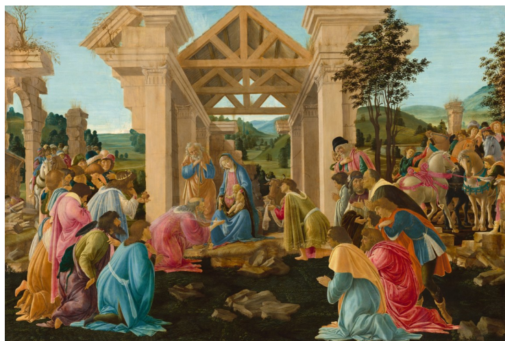
The Adoration of the Magi by Sandro Botticelli (c. 1478/1482).

This poem was published in Verses (E. & J. B. Young, 1893). This poem is in the public domain.