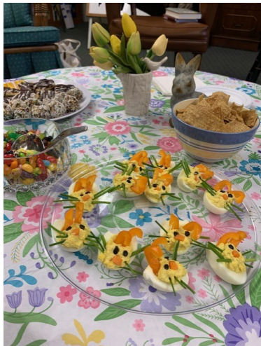
Treats at March's Books and Bites

The Books & Bites group met on March 19th to enjoy some snacks and discuss the great, and not so great, books they have been reading. Recommendations include James McBride's The Heaven and Earth Grocery Store about a Jewish and African American neighborhood in Pennsylvania, Glen