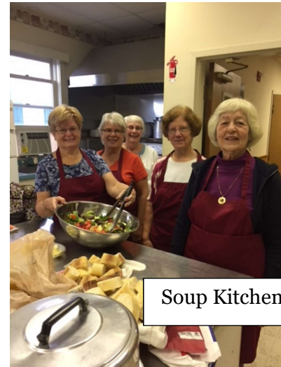
Soup Kitchen Cooks

If you have faith the size of a mustard seed, you will say to the mountain, "Move from here to there and it will move: and nothing will be impossible to you." - Matthew 17:20