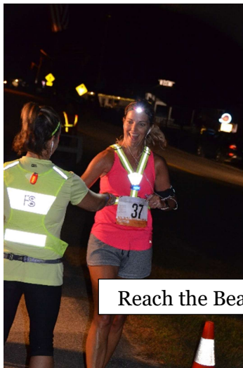
Reach the Beach Relay

We have always been 5-for-5 in our mission giving and we support a different mission partner every month, including Habitat for Humanity, New Beginnings (a domestic abuse shelter), and 25:40 (supporting education and health awareness in Africa).