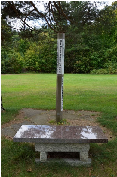
Rob Leighley Memorial Peace Pole "May peace prevail."

And so in 1838 the congregation constructed just such a "token of devotion" in the form of our traditional church building surrounded by a cozy New England village on the shore of beautiful Lake Winnepesaukee with its supporting cast of striking distant mountains.