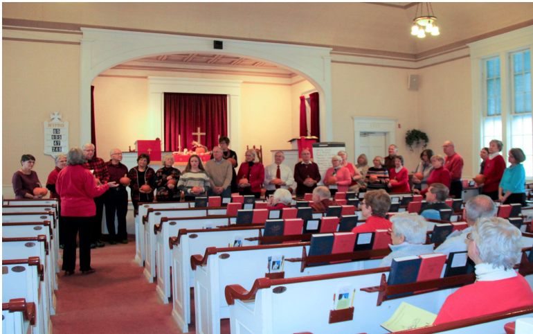
Commissioning officers and committee members on Reformation Sunday