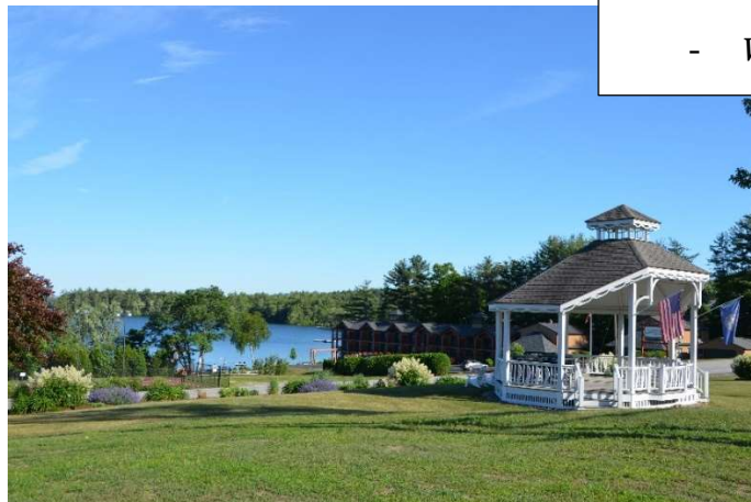
Center Harbor Bandstand

Before the mountains were born or you brought forth the whole world, from everlasting to everlasting you are God. - Psalm 90:2